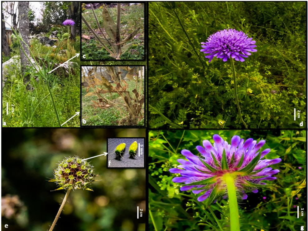
Fig. 1. General appearance of Knautia arvensis (L.) Coult. (a = plant habit; b = basal leaves; c = cauline leaves; d = inflorescence; e = capitula; f = achenes; g = involucre bracts).

Knautia arvensis (L.) Coult., Mém. Dipsac. 41. 1823; 41. 1823. Basionym: Scabiosa arvensis L., Sp. Pl.: 99. 1753 – Lectotype: Herb. Burser XV (2): 5 (FERRER-GALLEGO 2014).